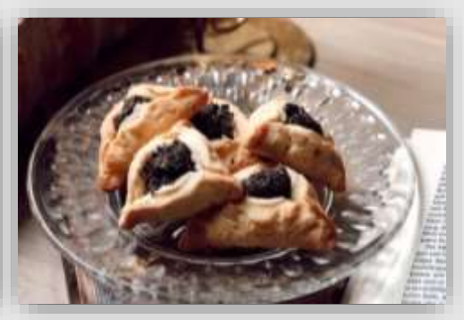
Day 5: Jewish cuisine