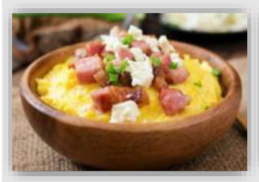
Day 10: Banosh (corn meal) and Hutsul cabbage rolls