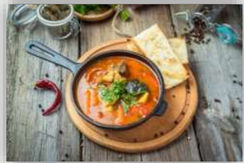
Day 9: Bograch, 'Shopsky' salad and steamed sweet cherry and blueberry varenyky