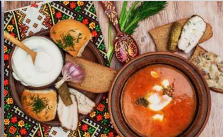
Enjoy an exclusive Hutsul experience