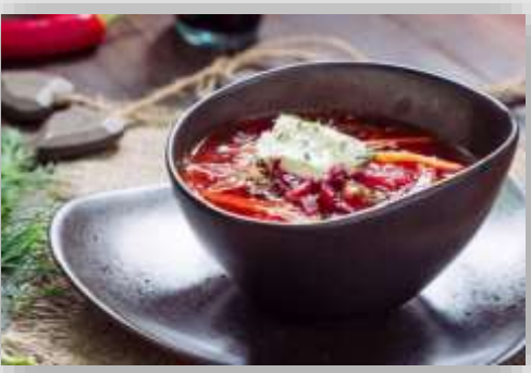
Day 3: Borshch and Deruny (potato pancakes)